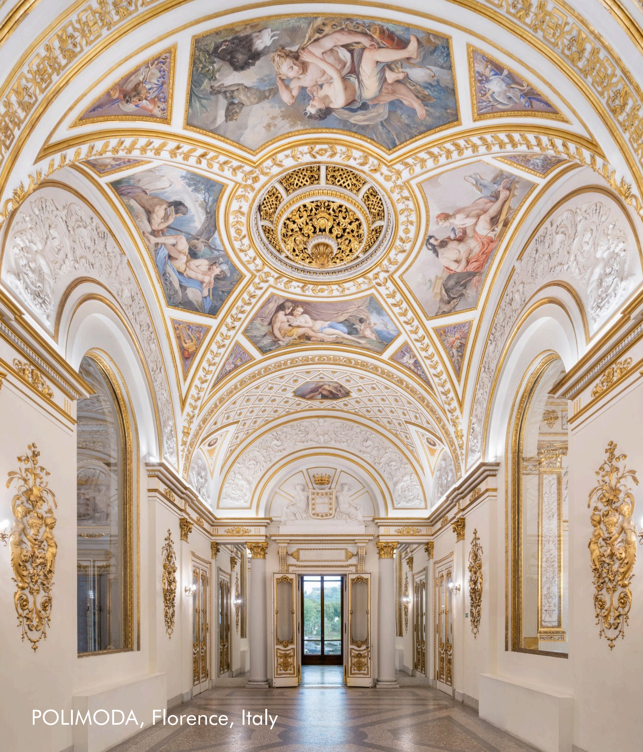
POLIMODA, Florence, Italy